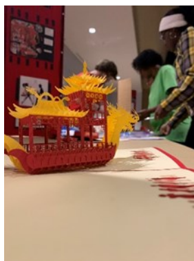
Left: Club displays of Chinese artifacts.