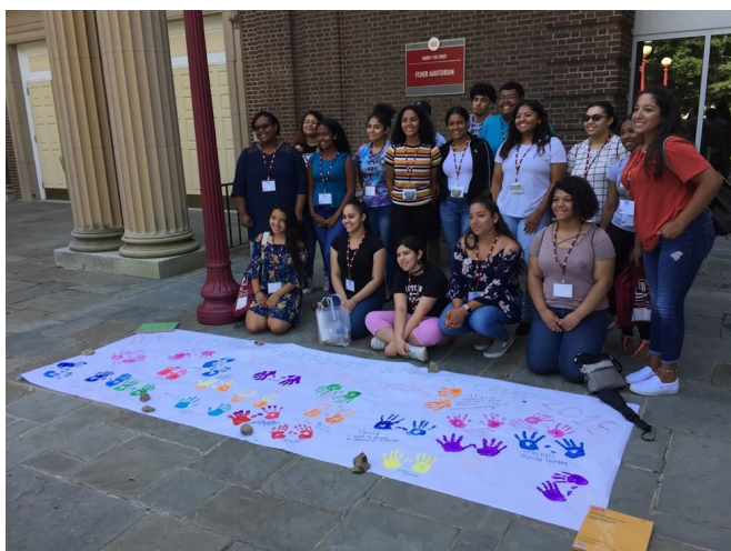
Above: attendees of the camp after one of their “hands-on” activities.

In July 2018, the Hispanic Heritage Council (HHC) held the first Pre-College Latino Leadership Summer Program. Aimed at high school students from 10th to 12th grades, the camp was attended by 18 students from the Allentown and Lancaster areas, accompanied by four chaperones. They had the opportunity to get better acquainted with IUP, its campus, programs, and resources as they decide on their future college careers. They participated in different activities organized by HHC, including exploration of their identity, their possibilities for future careers, presentations about leaders of the Hispanic world and others. They stayed for three days in one of our dorms, making their college experience more complete. The program was a success as some have already shown interest in IUP.