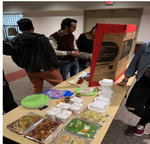
Above: Chinese food provided by the CLC Club