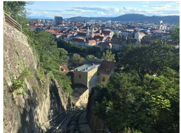
A view of the “Altstadt” of Graz in Austria from the “Schlossbergbahn”

“As part of the program that brought me to Austria, I had to take a German class. Knowing at this point I had already taken three semesters of German here, I decided to take the fourth level German class. As I soon found out, the fourth level German class was designed to increase the fluency of a person already fairly well versed in the German language. That person was not me. Though with a lot of practice and a little bit of fear-inspired studying, I was able to hold my own fairly well in the class.”