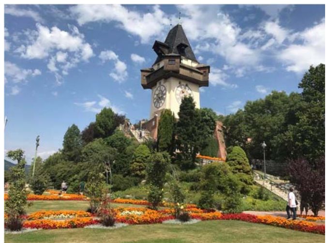
The only remaining part of the castle that sat on top of the Schlossberg Mountain from the flower garden