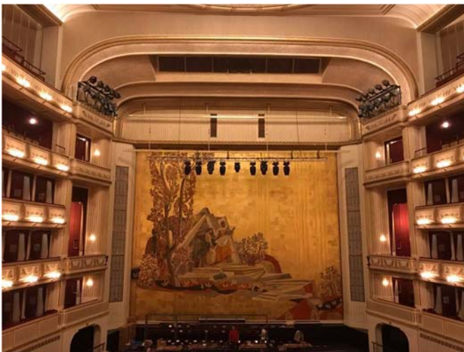
The stage of the Vienna Opera House with the iron curtain down for the off-season repairs and updates

“The intersection of music and language is where I found myself over the summer, and being in that sort of environment allowed me to thrive as a musician and as a language learner. With the support of the German faculty here at IUP and the Department of Music, that love continues daily.”