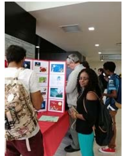
Right: Many other faculty members and students stopped by.