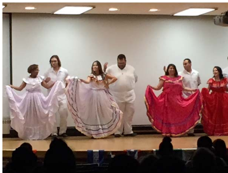
Above: Ritmo Latino performing a traditional Nicaraguan folkloric dance