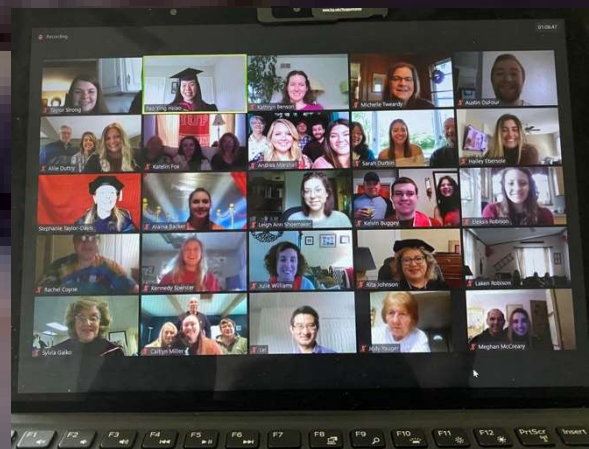
Food and Nutrition's Virtual Ceremony

On April 7, a "supermoon" occurred, meaning the full moon occurred within 90% of perigee, its closest approach to Earth in orbit. The April full moon was the "most super" of the supermoons in 2020 since it was slightly closer than all other full moons.