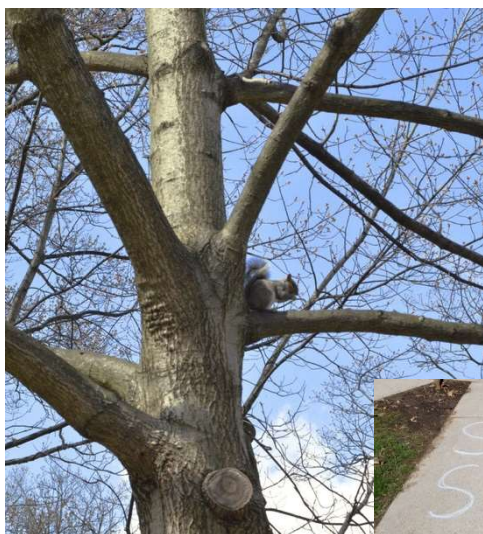
The Oak Grove remains a quiet spot for squirrels and sidewalk scribblers!