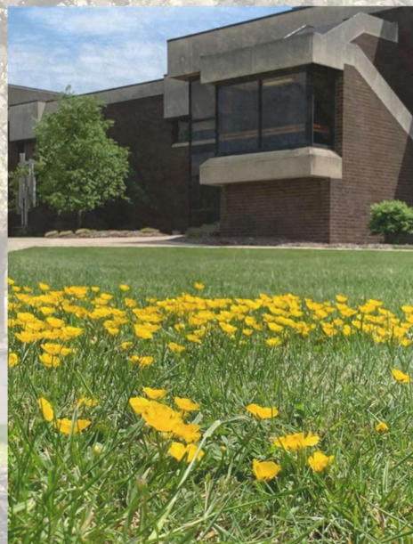
Wildflowers bloom in front of Zink Hall.